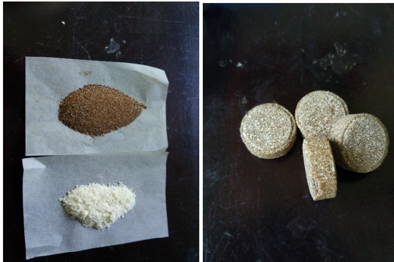
Figure 1. Formulation of the effervescent decaffeinated coffee tablet