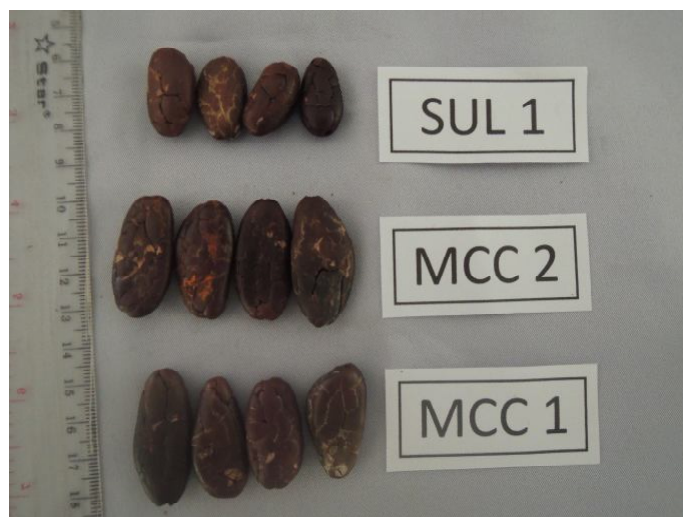
Figure 5. Nib size of MCC 01, MCC 02 and Sulawesi 01

Note b : Classified according to Indonesian National Standard (SNI), namely AA (maximum 85 beans per 100 g) or 1.17 g per dry bean, A (86–100 beans per 100 g) or 1.16–1.0 g per dry bean, B (101–110 beans per 100 g) or 0.99–0.90 g per dry bean, C (111–120 beans per 100 g) or 0.90–0.83 g per dry bean, and S (>120 beans per 100 g) or <0.83 g per dry bean.